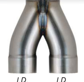
Standard Both Legs Swedged